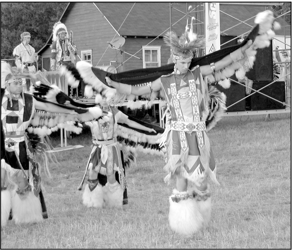
Kwahadi Dancers perform the Eagle Dance

Every member of the Kwahadis is an active Scout with another unit around Amerillo. The Scouts make their own costumes and carefully learn the culture so that they can accurately honour the dances and the native peo-