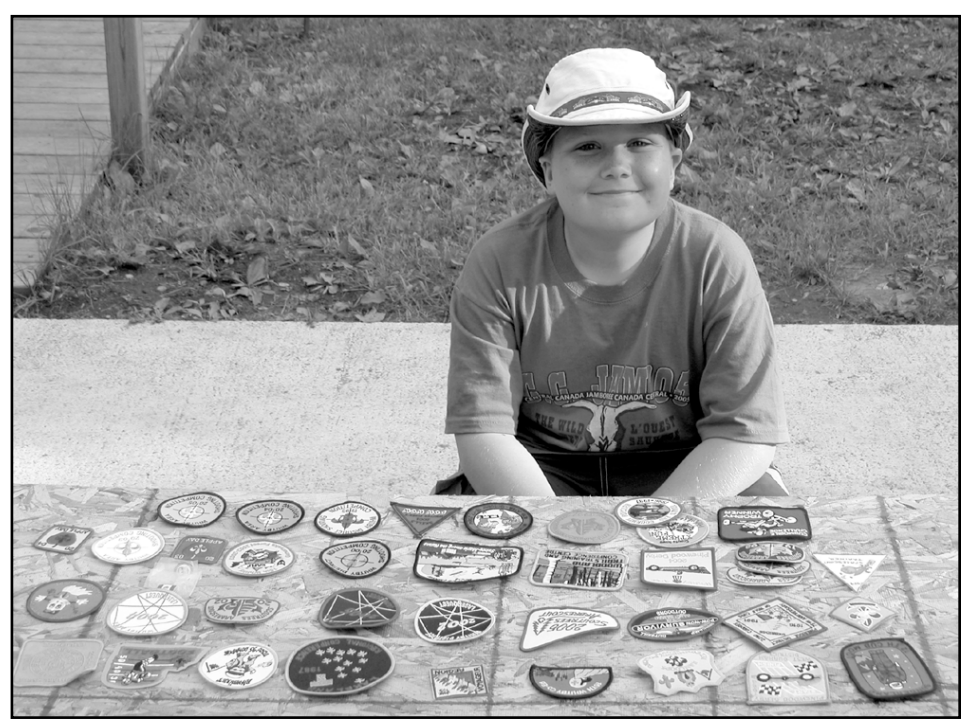
Ready to trade at the Badgers' Club display